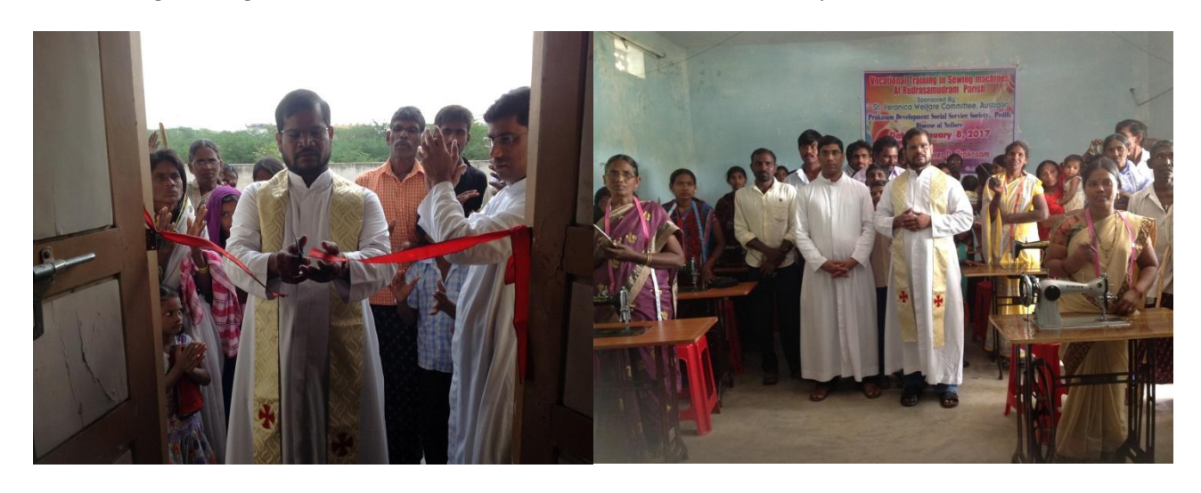
Tailoring Center at Bestavaripeta Parish started on January 17, 2017

Tailoring (Sewing ) Center at Rudrasamudram Parish started on January 8, 2017