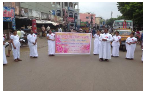
Fvtrs Group Visit